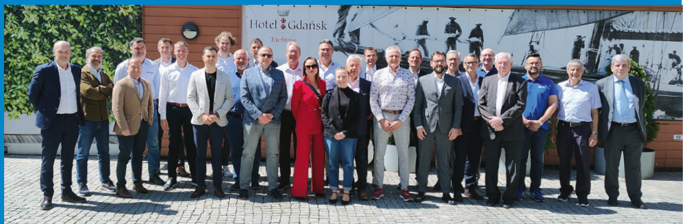
The Participants of the EGEA General Assembly in Gdańsk.

The financial report was presented, and the board was discharged for the 2023 finances. The appointment of the new Secretary General was discussed and approved, as well as the European Court of Justice's ruling on the legality of restricting third-party access to vehicle OBD ports. The meeting also covered legal cases involving Osborne and Clark and budget allocation and commitment, as well as the green light to start negotiations with the VMs concerning the recent Court of Cologne ruling.